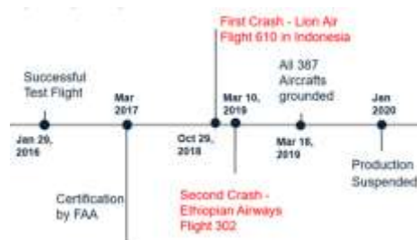
Figure 1. Major timeline of Boeing 737 MAX

The Boeing 737 MAX has been making international headlines since its grounding in March 2019, after two crashes in five months caused 346 deaths. Figure 1 shows the major events in the timeline over the four-year period. The Boeing 737 MAX 8, a fourth generation Boeing 737, first flew on January 29, 2016, gaining Federal Aviation Administration (FAA) certification in March 2017. It entered service in May 2017 when it was delivered to Malindo Air, a carrier owned by Indonesian Lion Air Group headquartered in Malaysia. By November 2020, 387 aircraft of this model were produced and delivered, with 4,039 orders unfulfilled. (Boeing, 2021)