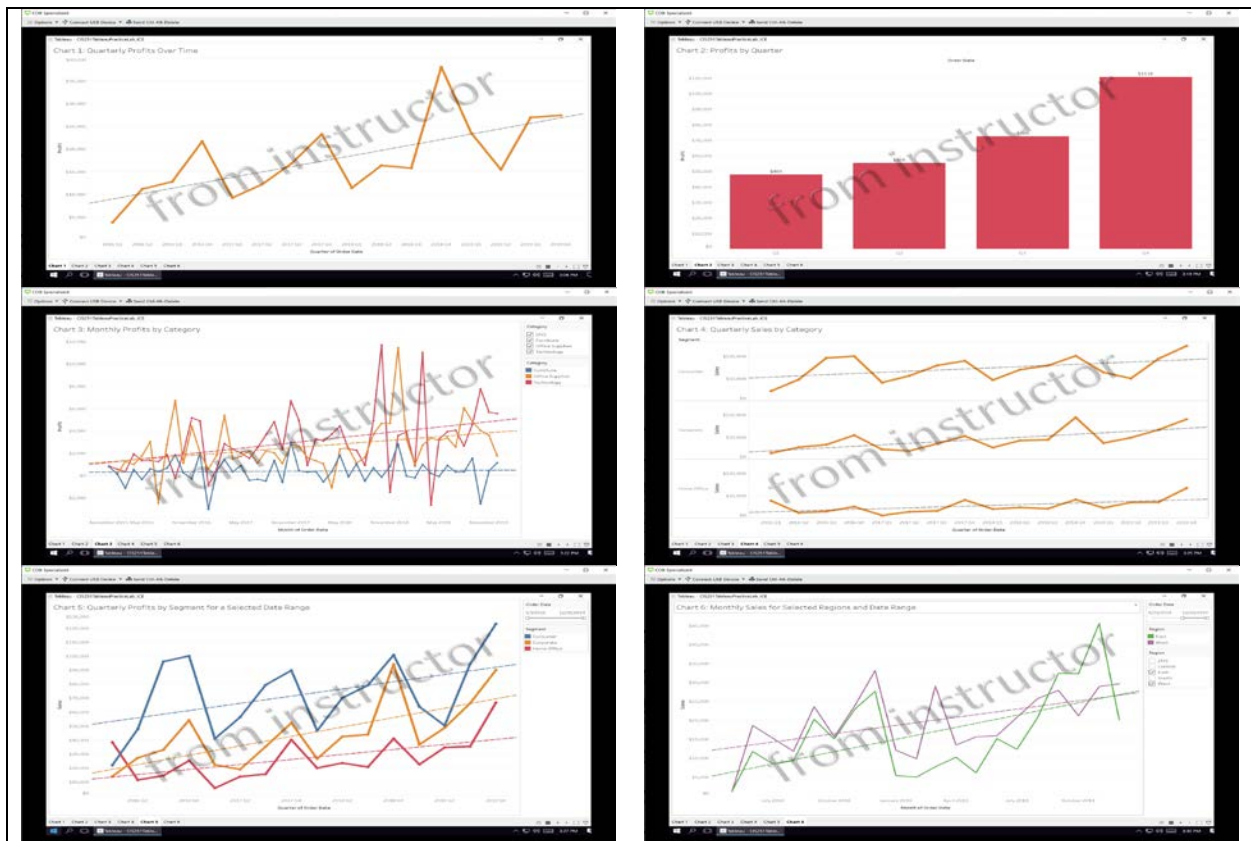
Figure 4. Images with Watermarks of Finished Tableau Practice Lab Available to Students

Students were also able to see screenshots of the finished project, just as they were in previous Excel labs. In addition, the Tableau practice lab chart images also included watermarks to make sure students did their own work (see Figure 4 below).