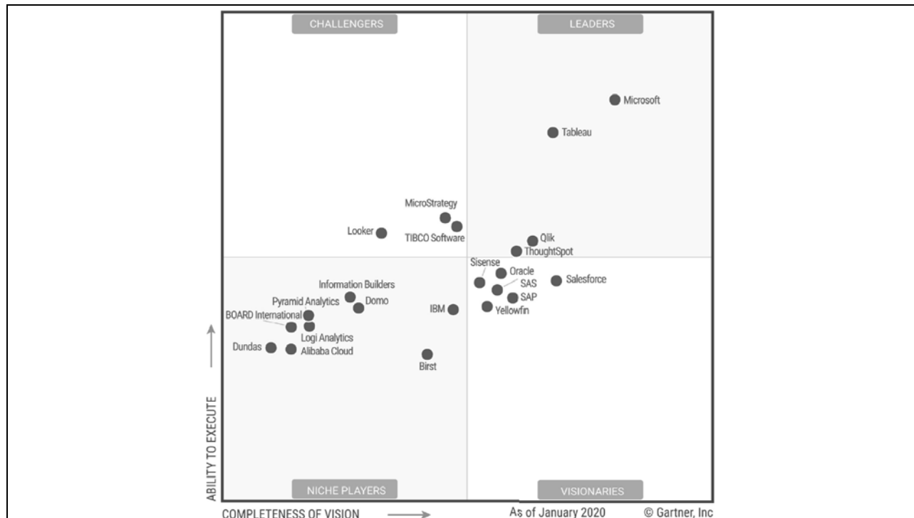
Figure 1. Gartner’s Magic Quadrant for Analytics and Business Intelligence Platforms

Tableau began with Stanford University research aimed at developing an interactive visual exploration tool that facilitated exploratory analysis of data warehouses with rich hierarchical structure (Polaris: interactive database visualization, n.d.). The research drew on three different areas: formal graphical specifications, table-based displays and database exploration tools (Stolte & Hanrahan, 2002). The result was a tool that could create sophisticated visualizations using simple drag-and-drop operations to construct a visual specification (Stolte, Tang & Hanrahan, 2008).