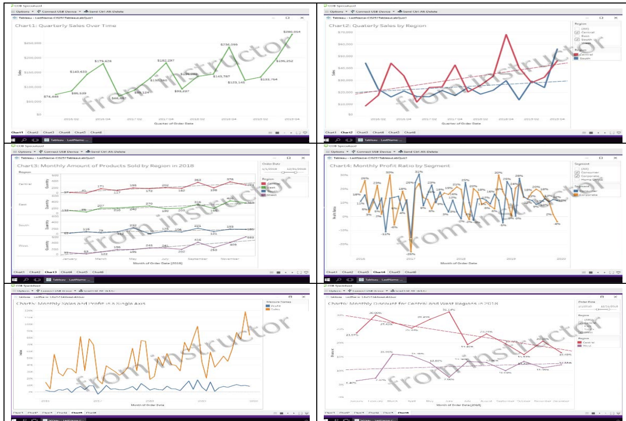
Figure 6. Images with Watermarks of Finished Tableau Lab Project With Tableau Lab Quiz 1

Again, students were given images of the finished lab charts with watermarks (see Figure 6 below).