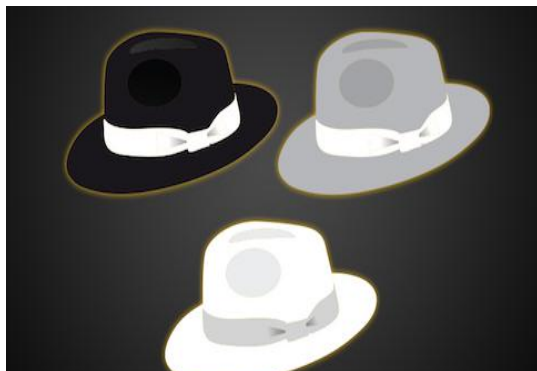
Figure 1. Hackers: Black, Gray & White Hatters

Although the word hacker tends to evoke negative connotations, it is important to remember that all hackers are not created equal. Figure 1 depicts the visual salient and material differences which are not obvious to the unsuspecting employee when approached by a social engineer.