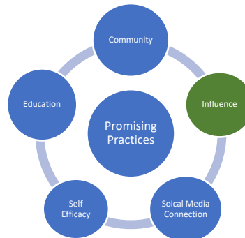
Figure 1. CISSE Model (Rowland, 2018)

media connection, increase in self-efficacy, and education are promising practices to anchor girls in a cybersecurity career path. These promising practices inform programs that are recruiting and motivating girls to explore this field.