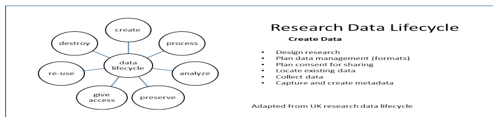
Figure 1. Research Data Lifecycle (U.K. Data Archive)

Data used in research can be in many forms such as characters entered through a keyboard, biospecimens, images, video recordings, paper notebooks, and drawings. It can be captured through observation, machine generated algorithms, historical record abstracts, recordings, and through other physical means. At it's most basic level, data can be defined as "facts and statistics collected together for reference and analysis" (Data, 2018) and from a research perspective can be defined as that which "is collected, observed, or created, for purposes of analysis and to produce research results" (University of Edinburgh, 2018). Each stage of the research data lifecycle (Figure 1) has implications for the researcher to insure that adequate safeguards are in place for the protection of the data and is in compliance with local, state, federal laws, and organizational requirements.