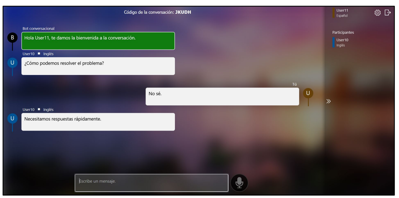
Figure 1: MS Live Translator Sample Screen Showing Comments in Spanish

Up to 500 people can converse simultaneously using Android, iOS or Windows devices for up to four hours. The host can save a transcript at the end of the meeting, but a prior conversation cannot be uploaded. That is, group members see only live conversation; there are no asynchronous discussions as were available with the academic system used in many other studies. Also, perhaps most importantly, as mentioned, the dialog appears as 'speech bubbles' constantly, perhaps distracting the group member with their frequency. With the academic system, users could choose when to see others' comments. The academic system powered by Google Translate provided support for more languages (103), allowed anonymous comments, had no time limits, and had, theoretically, no upper limit for group size.