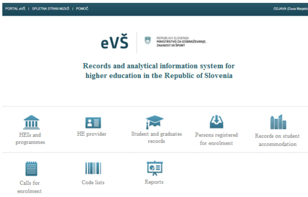
Figure 1. Home Page of the eVŠ Information System on User Login

The eVŠ includes a database with the following records: